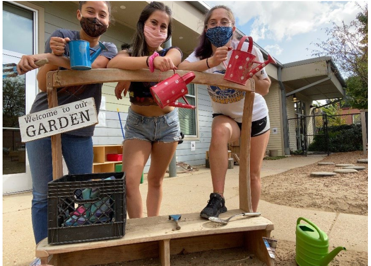
Grateful that our friends from SPEAR visited The Acorn School playgrounds on the most recent in-service day to freshen our winter garden plots!

The Acorn School offers a Nature Education program to young children. Aided by parents and community partners, this important initiative includes daily access to outdoor play spaces. It facilitates science learning and supports emotional wellbeing through gardening, predictions of light, shadow, wind and weather, and observing how seasons change the world of birds, insects, animals, and plants in our neighborhood. Rich and abundant opportunities for learning can be found simply walking through the arboretum, the children become knowledgeable about trees, how these are different and similar, by looking up the trunks through the canopy and looking down at roots and collecting fallen leaves and seeds on the ground. The Acorn preschool experience culminates in the K-Camp program the July before children matriculate to Kindergarten, a capstone month of all day outside explorations that empower children through risk and rigor to reinforce the 21st century skills (core competencies) of creativity, communication, collaboration and critical thinking.