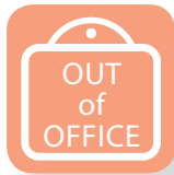
PTO (staff) (except temporary)