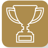
Go for the Gold