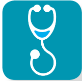
Choice CDHP with HSA