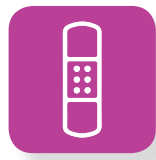
Short-term disability (staff only)