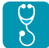
Choice CDHP + HSA with VU contribution