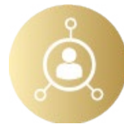
Employee Assistance Program