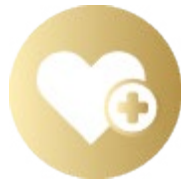
Life & AD&D