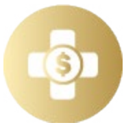
HSA Personal contributions only