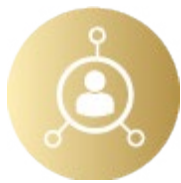
Employee Assistance Program